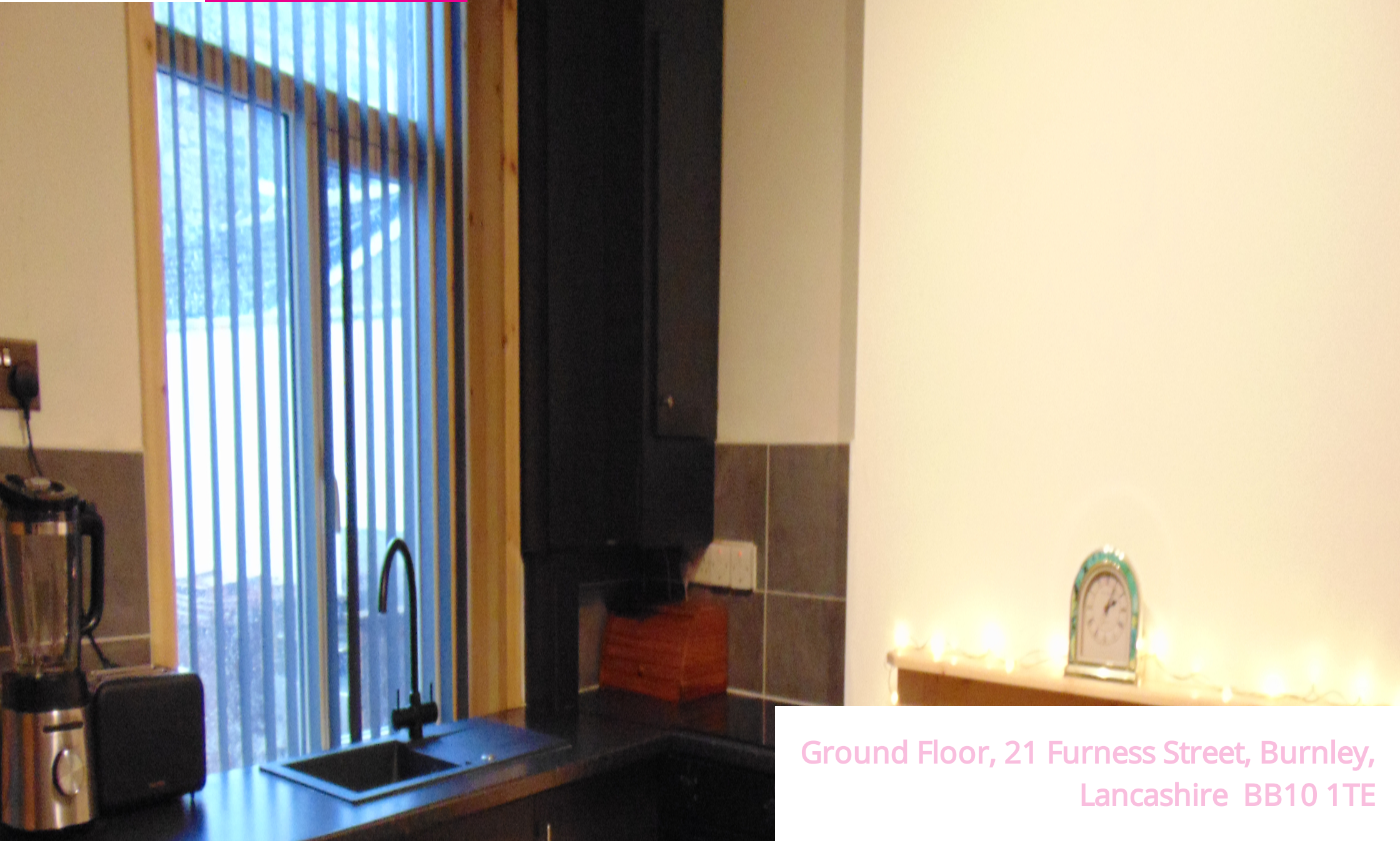
Ground Floor, 21 Furness Street, Burnley, Lancashire BB10 1TE