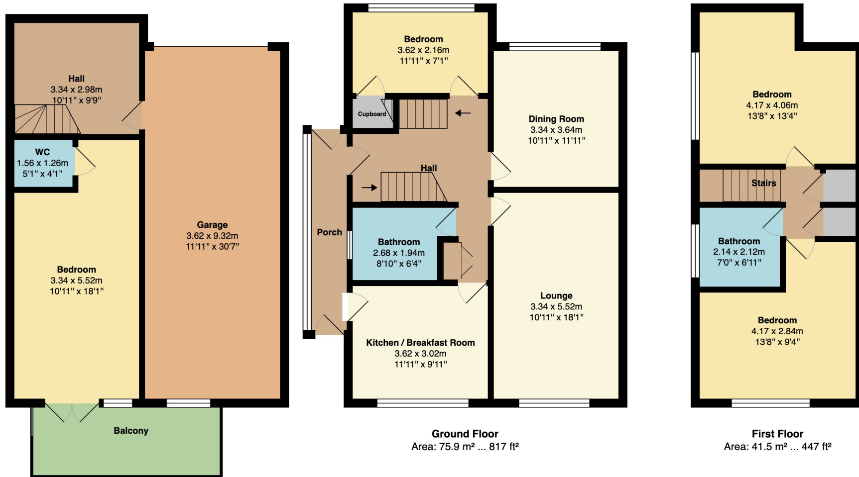
Lower Ground Floor Area: 68.9 m 2 ... 741 ft 2