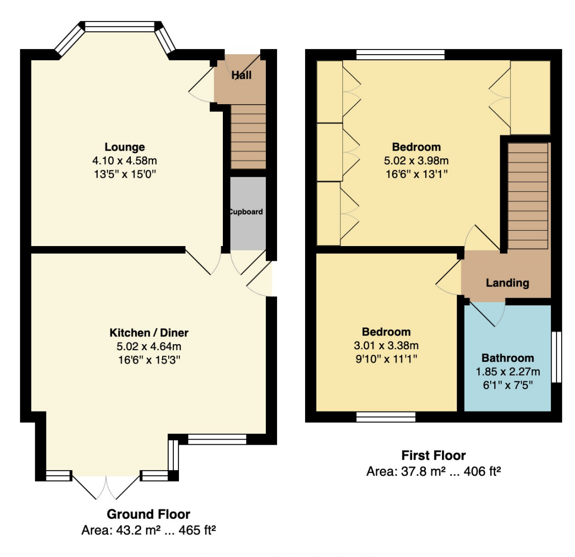
Total Area: 80.9 m<sup>2</sup> ... 871 ft<sup>2</sup>