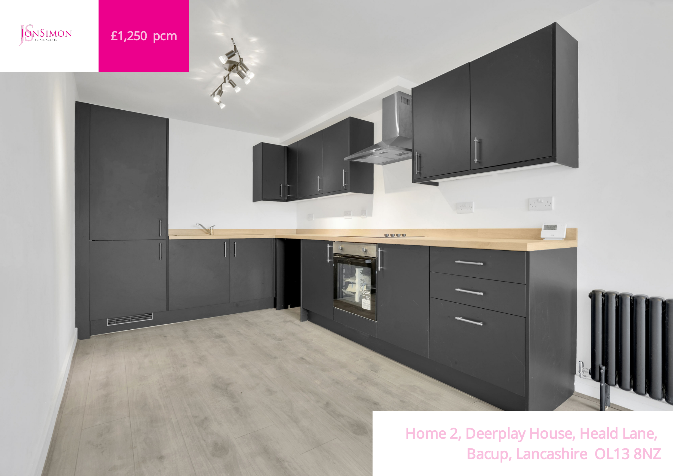
Home 2, Deerplay House, Heald Lane, Bacup, Lancashire OL13 8NZ