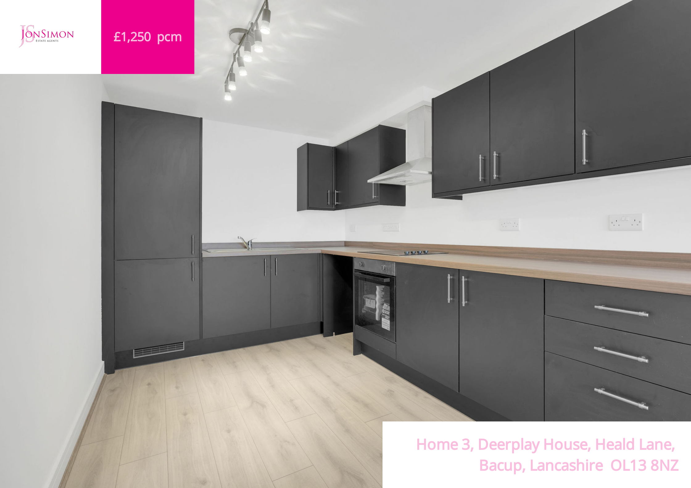
Home 3, Deerplay House, Heald Lane, Bacup, Lancashire OL13 8NZ