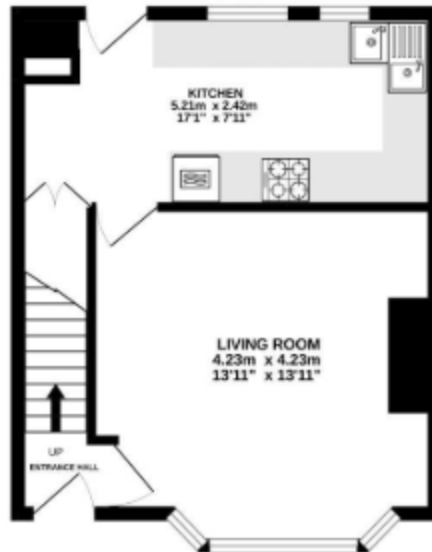
GROUND FLOOR 32.5 sq.m. (350 sq.ft.) approx.