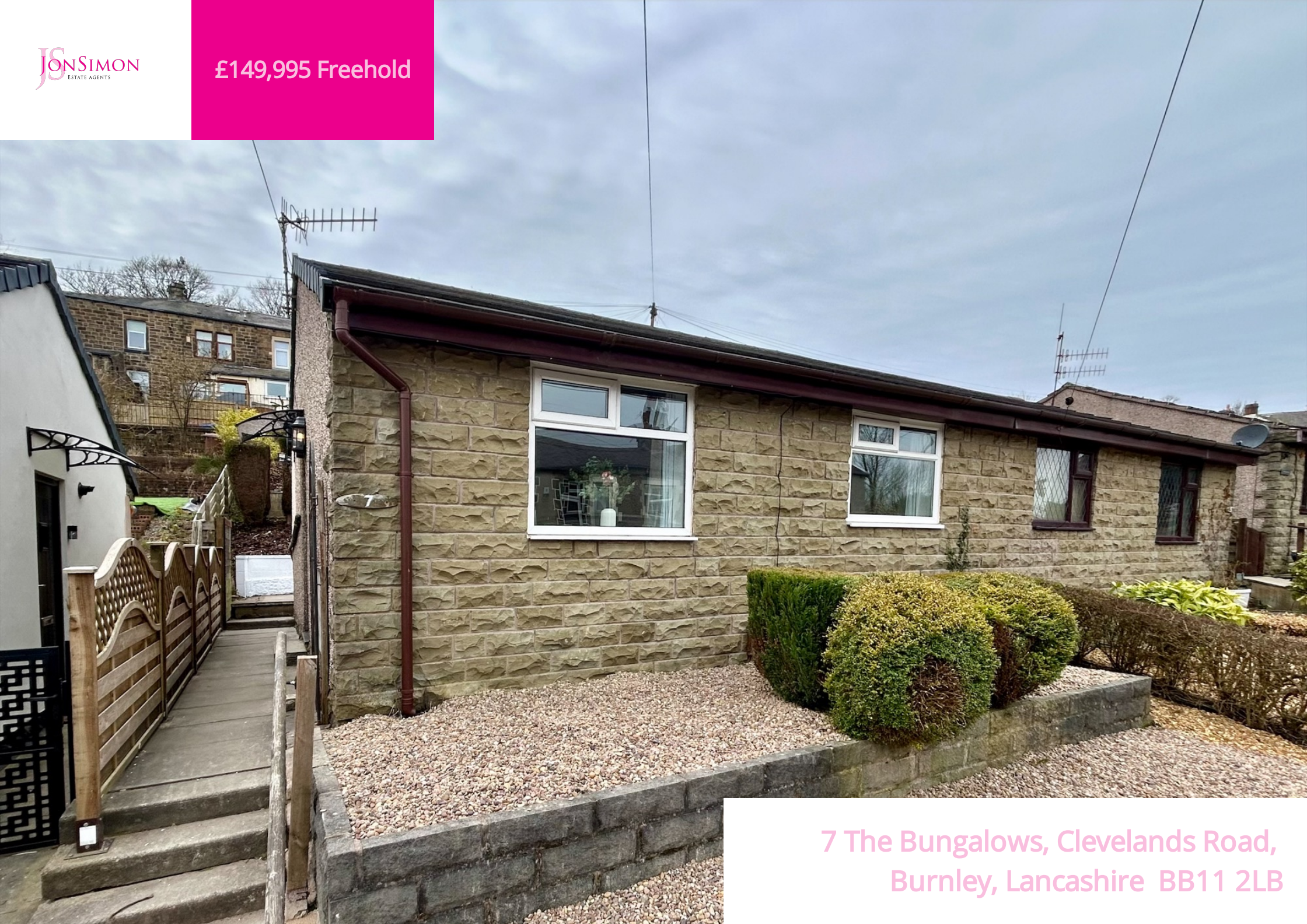
7 The Bungalows, Clevelands Road, Burnley, Lancashire BB11 2LB